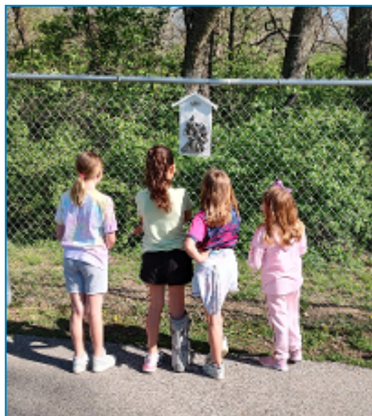
Students are enjoying the new outdoor Stations of the Cross on the playground