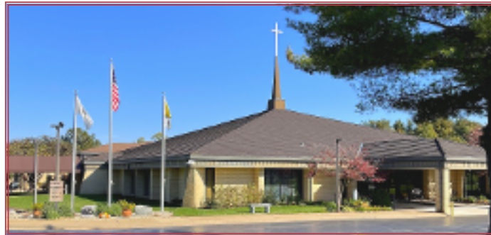
ST. AMBROSE, GODFREY